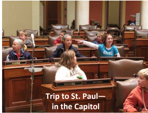
Trip to St. Paul—in the Capitol

On average, over 60% of SEAS students take honors classes in high school.