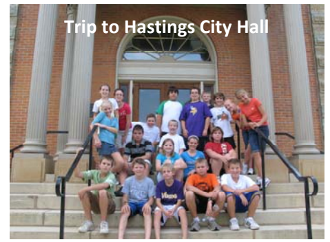
Trip to Hastings City Hall

“At SEAS they hold their students to a higher standard both academically and socially. He would learn about serving others in our community and at school, he would also learn about respecting life and his classmates. We knew SEAS School would do all this and more.”