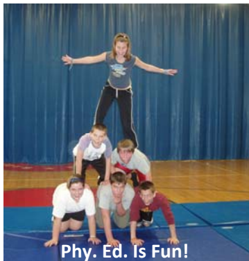
Phy. Ed. Is Fun!